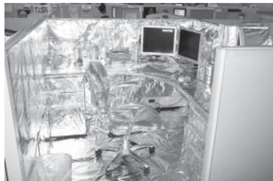
Running in the New Millennium