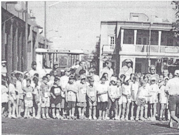
A record 300 youths participated in the 1K run.