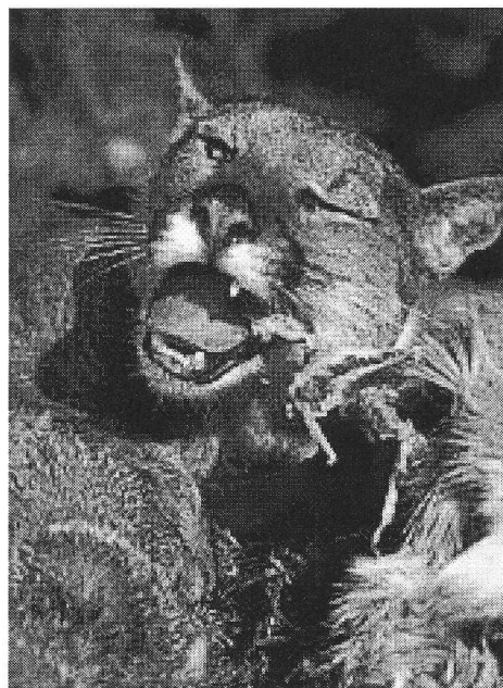
A specimen of Mountainus Lionus, reported recently chasing a run on Aspen Vista.

The Corrida de Los Locos, the Striders' popular mid-winter run, has yet to be scheduled but normally takes place in January or February. Various locations have been used, including the "La Tierra" area north of town, the Santa Fe Downs area, and Las Campañas. If you wish to be involved in the planning of the year 2000 Locos Run, attend the upcoming Striders meeting and "Go Locos"!