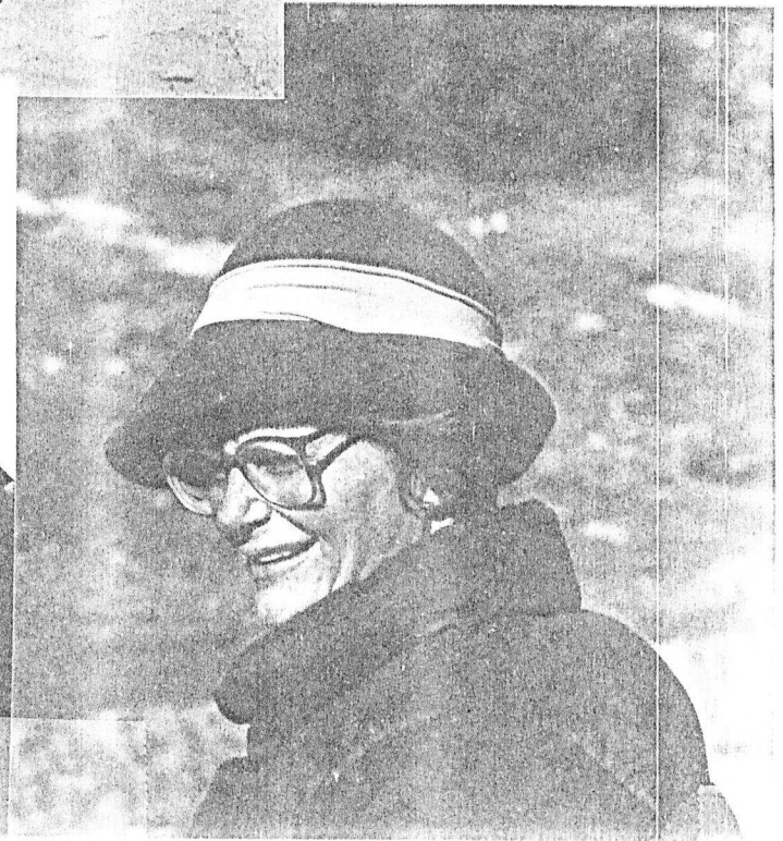
"Corrida de los Locos"